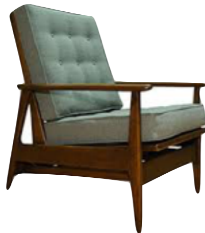
5) Reclaimed Wood Chair